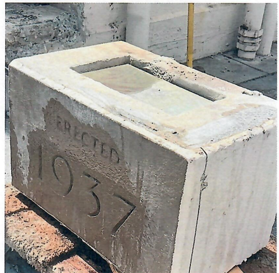
Time Capsule inside cornerstone