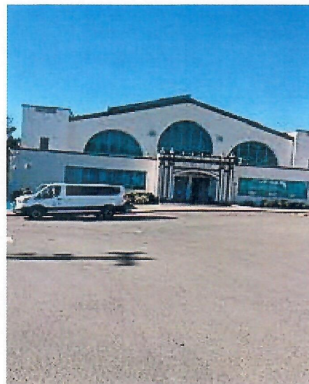
Current Jeff High Gymnasium