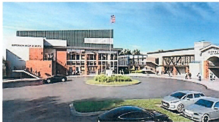
Preliminary artist rendering of the new Jefferson High School Gymnasium