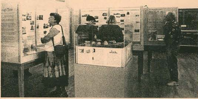
Museum visitors taking a "Walk Through Time."