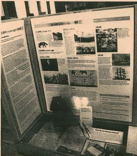
Close-up view of timeline exhibit.