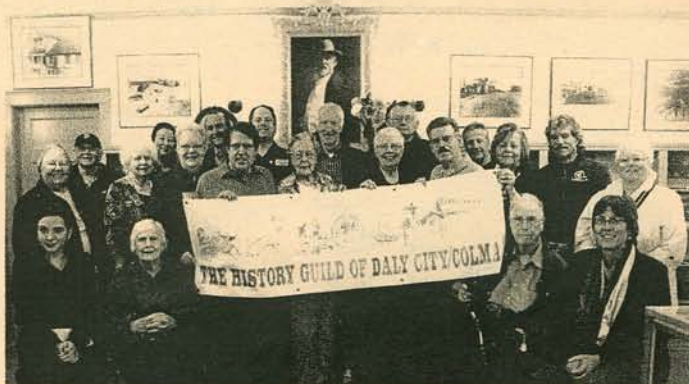
Group picture in front of the fireplace at March 17 th "hearth warming" at our Daly City Museum.