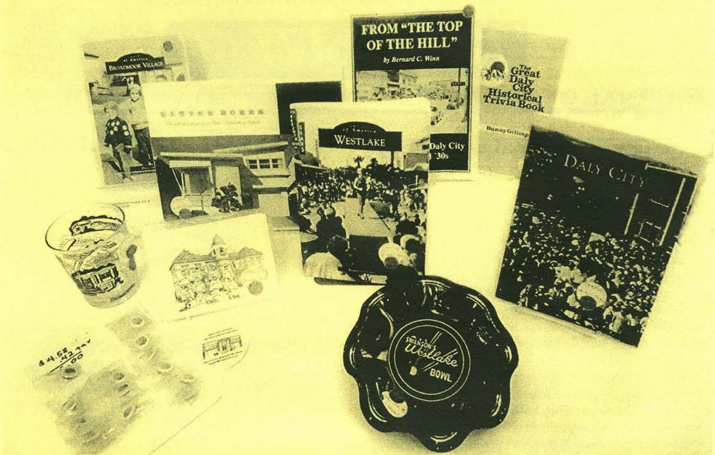
The museum store has the advantage of offering a full selection of books on local history and some interesting gift items. Buy your "Centennial" gifts!