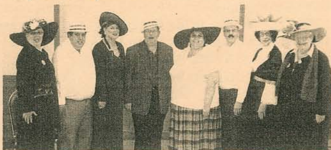
Centennial music performers, January Member Meeting