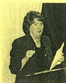
Memories Dinner attendees