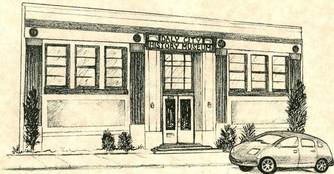
Daly City History Museum, 2009