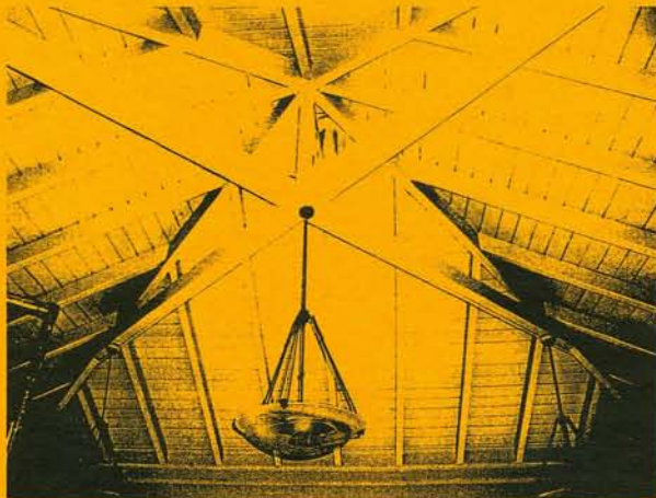
Ceiling of original room, freshly painted with new light fixtures

Westlake from sand dunes to suburb 60 years ago. Bunny’s previous books include Images of America: Daly City and The Great Daly City Historical Trivia Book , illustrated by Ken Gillespie.