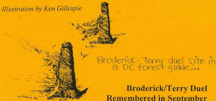
Illustration by Ken Gillespie

David Colbreth Broderick (1820-1859) , member of California State Senate, 1850-52; Lieutenant Governor of California, 1851-52; U.S. Senator from California, 1857-59; died in office 1859. Mortally wounded in a duel on September 13, 1859 with David S. Terry, Chief Justice of the California Supreme Court, and died in San Francisco. Interesting website dedicated to politicians who participated or were killed in dueling: http://politicalgraveyard.com/special/duel-participants.html