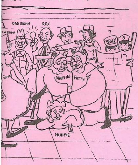
Shown is a flyer for the original production of Dear Old Colma back in May of 1960.